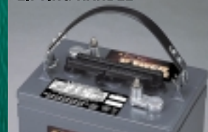
CONVENIENT LIFTING HANDLE

This battery includes a variety of design features that allow for easy watering and installation, faster maintenance turnaround times and longer cycle life. East Penn engineers completely redesigned every aspect of their original golf car battery to create a better product that is as durable and user-friendly as possible. This battery is made with pride by quality craftsmen in our state-of-the-art manufacturing facilities, and subjected to over 250 rigorous quality control checks during every phase of production.